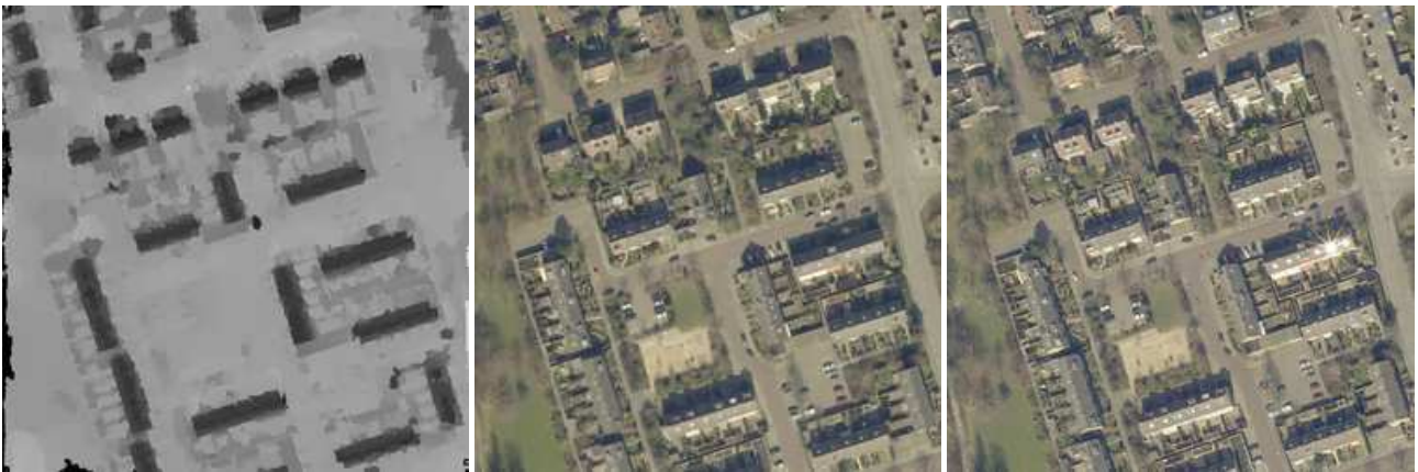
Figure 5: Expected value of depth (left) and the estimated orthoimage y^* (middle). One of the input images is shown right. Note that the specular reflection of the sun in the input image. This disappears in the estimated orthoimage.

sufficient overlap between the images in flight direction as well as between lines of flight. The results in an almost full coverage of the scene, i.e. nearly every ground point is observed in at least two images. We had in total 68 images of size 11500 \times 7500 captured along three flight lines. The initial camera parameters are given and approximate solutions for the camera poses. The images have been matched using SURF features (Bay et al., 2006) and the camera pose was refined by sparse bundle adjustment (Lourakis and Argyros, 2004). The results of this calibration step are the refined camera poses and a set of 3-D points which are shown in fig. 2.