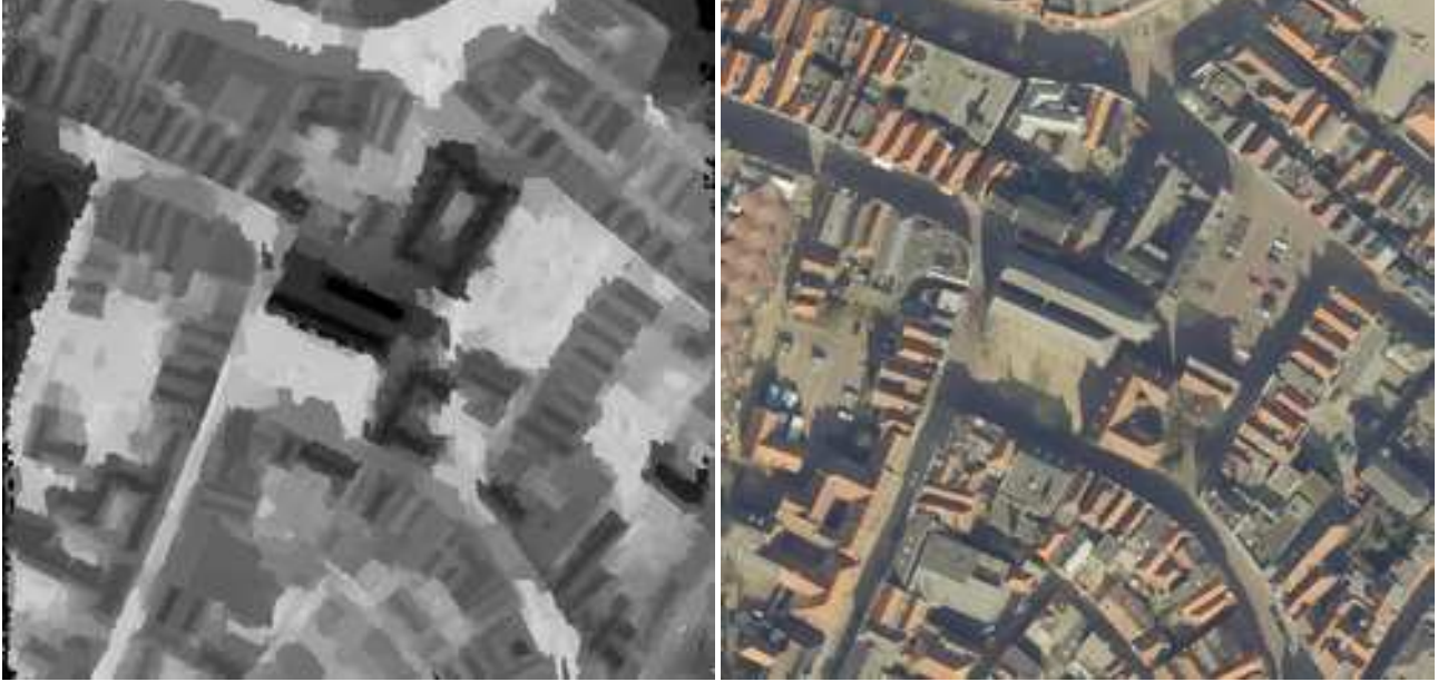
Figure 4: The expected value of depth (left) and the orthoimage y^* (right).