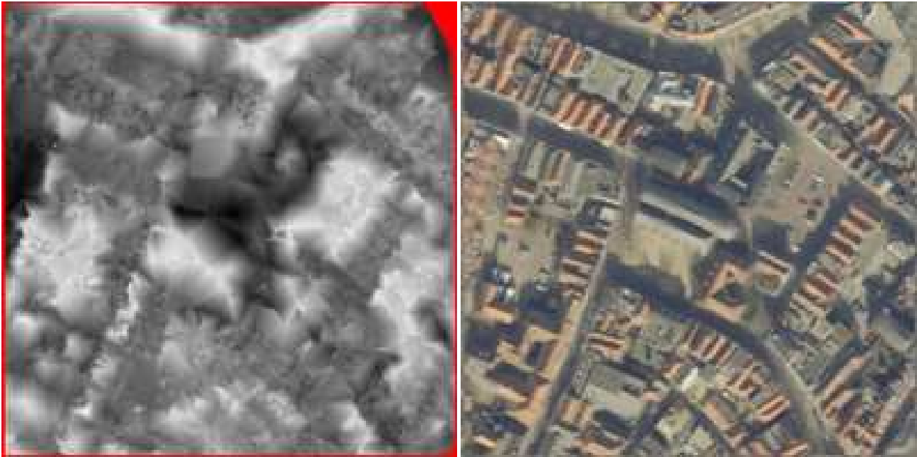
Figure 3: Initial depth map after triangulating the 3-D calibration points (left) and the corresponding orthoimage \mathbf{y}^* (right).