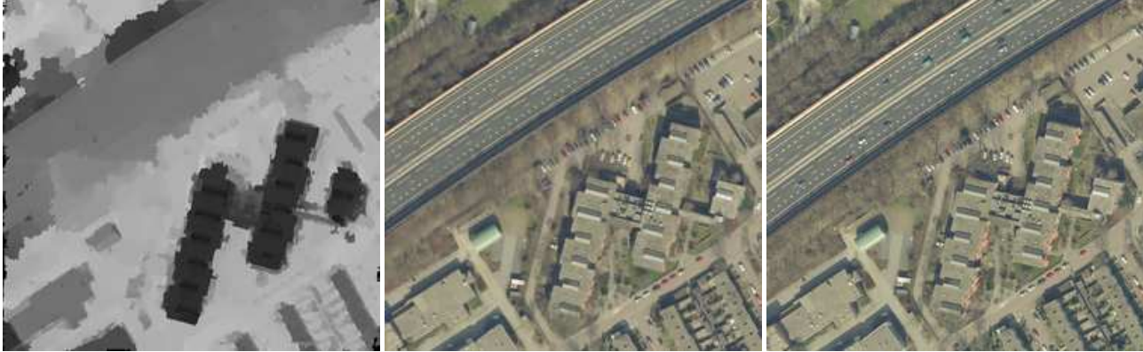
Figure 6: Expected value of depth (left) and the estimated orthoimage y^* (middle). One of the input images is shown right. Note that the cars disappear in the estimated ortho image.

image noise (eq. 8) and the colour transformation (eq. 9). The moving cars in the example in figs.6 and 5 are removed from the orthoimage y^* by the same mechanism. In this example we could find moving cars in all input images. Because of their movement, they are not consistent with the inlier model and correctly assigned to the outlier model.